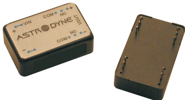
Unit measures 0.8"W x 1.25"L x 0.5"H